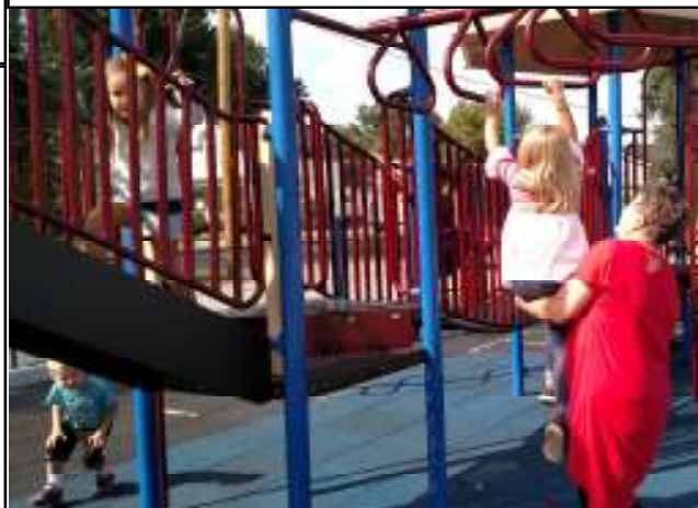
First day for our 4 Year Olds!