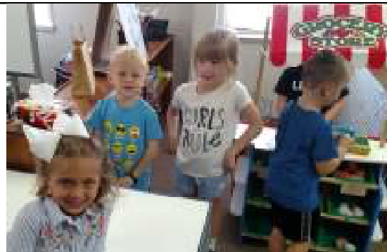
First day for our 4 Year Olds!

16 oz containers (like cottage cheese, sour cream, dips) Crayons, coloring books, puzzles for Before/After Care (used are fine!)